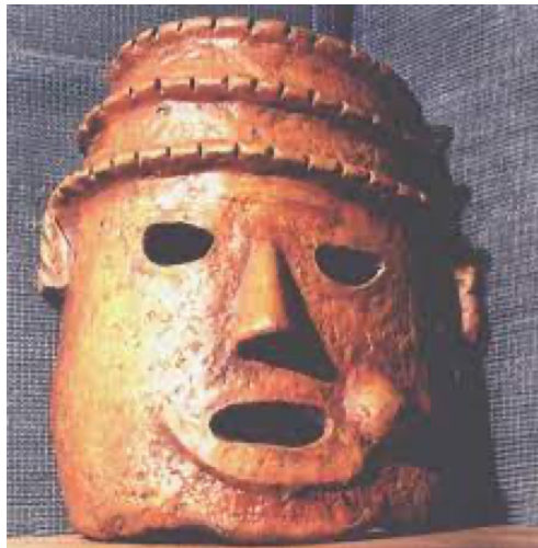
One of many pre-colonial ceramic representations of a person chewing

I suggest you start from minute 2:50 and end in minute 6:08. That's when the narrator talks about the Incas and how the Spanish took silver from the mines.